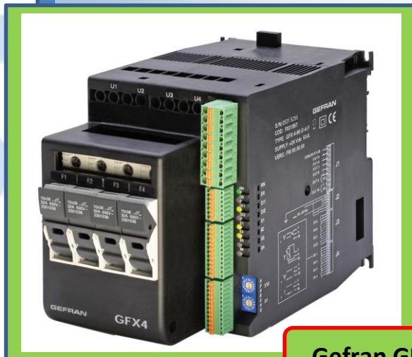
Gefran GFX4 Unit