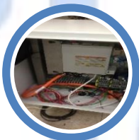
Dedicated EL Cabinet